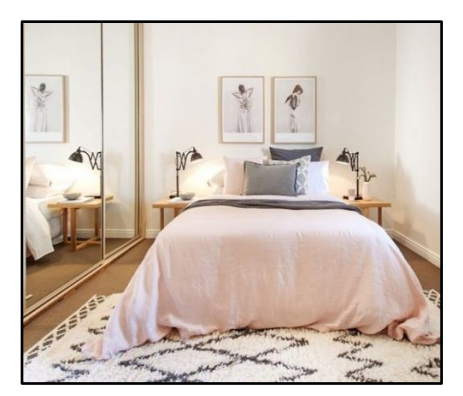
5. Get Creative with Storage You can use under-bed storage boxes to stash out-of-season clothing away, and custom shelving to store items such as shoes and books. You can even place a storage ottoman at the foot of your bed for extra seating and storage.