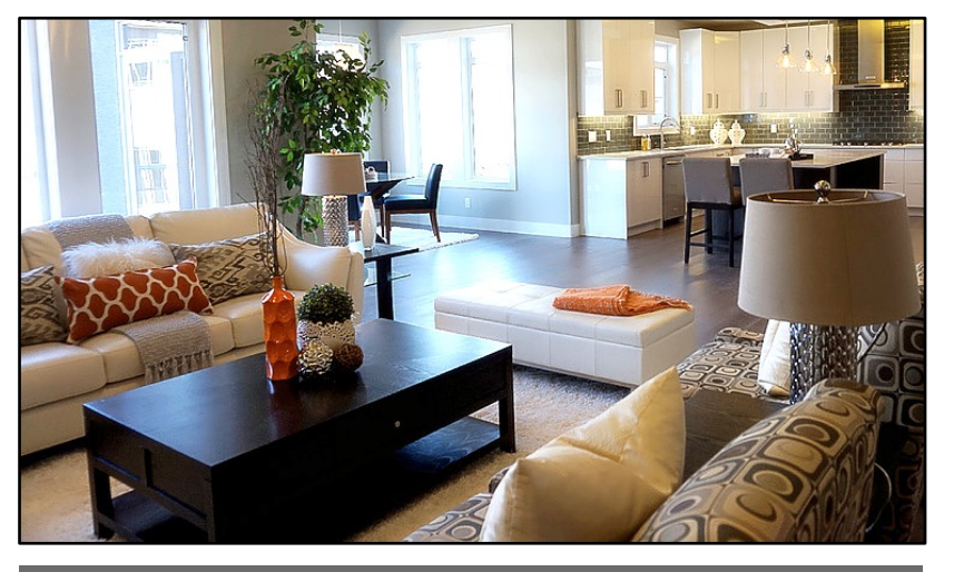
Tips & Tricks Decorating Ideas for Small Bedrooms

If your bedroom is on the smaller side, how you arrange the furniture in it can make all the difference in the overall feel of the room. Following are some tips for arranging a small bedroom and reveal the beautiful design potential of your space: